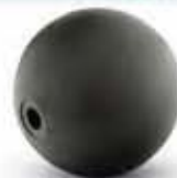
1-5/8" Spherical Soft Rubber