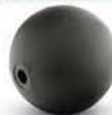
2" Spherical Polyolefin